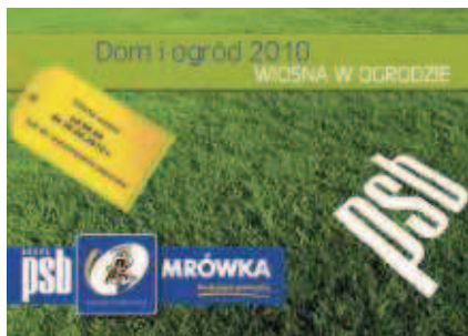
Seasonal catalogue of PSB-Mrówka stores "Spring"

The basic form of communication of the Mrówka network with clients are promotional campaigns – ten times a year local inhabitants are invited to shop through leaflets with special prices for selected products delivered to their houses. An important element of sales support are seasonal catalogues "Spring" and Autumn". Each of them contains an offer with a few hundred products most often purchased by clients in a given time of the year.