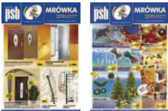
Promotional leaflets of PSB Mrówka – September, December

"Radio Mrówka" is very popular among customers and employees. This is a daylong service broadcasting songs, every quarter interwoven with various advertisements and messages e.g. local weather forecast, anniversaries, name day wishes, etc.