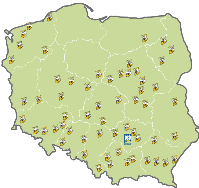
Map 2. Map of PSB-Mrówka network in 2010