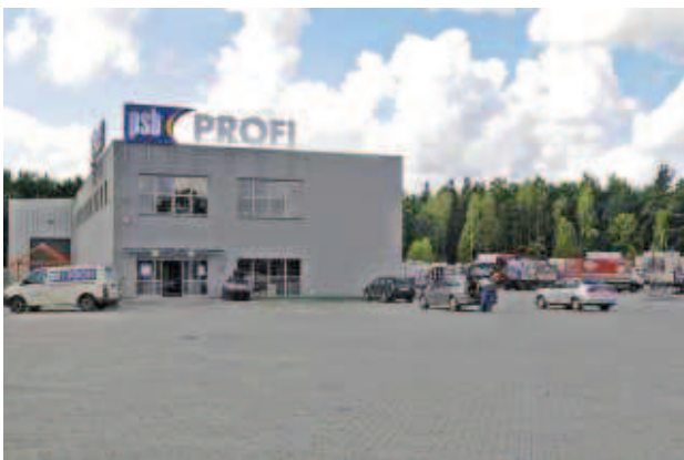
Picture 22. PSB-Profi, Biłgoraj

A standard PSB-Profi facility has the following zones: