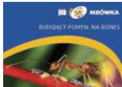
Guide "Building an idea of success"

We have developed basic assumptions for this concept – standards of contracts and the Visualisation Catalogue. The first Mini-Mrówka stores were built in Konin and Kamionki near Poznań. Both outlets have an area of approx. 500 m 2 . Mini-Mrówka stores, due to logistics will be mostly supplied by the local Mrówka market.