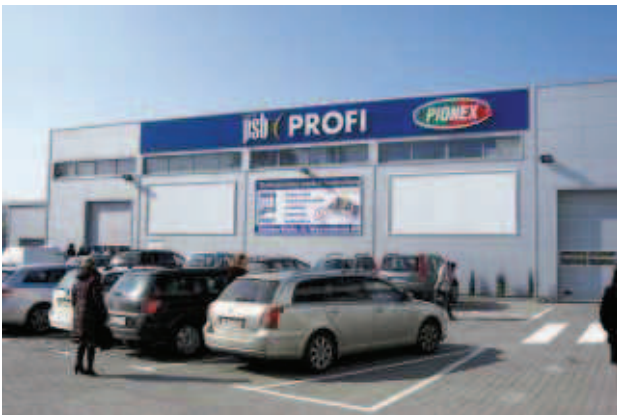
Picture 21. PSB-Profi, Bielsko-Biala