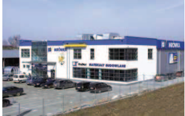
Picture 18. PSB-Mrówka, Stalowa Wola