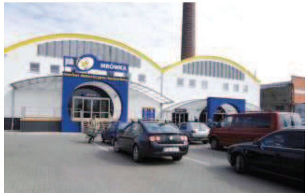
Picture 19. PSB-Mrówka, Włocławek

In the middle of the year, in the Company, the so-called auditors began work, high class specialists, whose task is consulting the owners and the management staff on the improvement of functioning of Mrówka stores in aspects such as management, merchandising and warehouse management. Within several months two specialists implemented repair programs in a dozen of supermarkets – as a result outlets significantly improved their efficiency – increased the number of customers and value of their purchases, and goods have been exposed better.