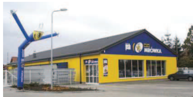
Picture 20. Mini-Mrówka, Kamionki

In 2011 we plan to increase the retail network to approx. 100 markets and stores – for that purpose we pursue television campaign, encouraging natural persons and business entities to invest in this project and we have issued a special guide entitled "Budujący pomysł na biznes".