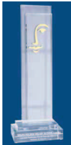
Picture 1. Winner of the contest of corporate social responsibility (CSR) - "Well Perceived Company" in Świętokrzyskie Province Business Centre Club

Since a long time the Company has remembered about its duties towards the community in which it operates. We support cultural events in the Świętokrzyskie region, offer financial or material support for numerous educational institutions, orphanages, hospitals, charities, associations for aggrieved families. Since 2003, the PSB Group has been sending, free of charge, the bi-monthly magazine "Głos PSB" to 270 construction high schools and more than 100 Practical Education Centres. Per year more than 36 000 magazines, containing the latest construction knowledge, reaches a few dozen thousand of students in the whole country. Total expenses, in 2010, for the aforementioned goals amounted to approx. PLN 200 000.