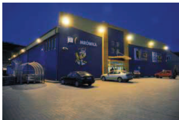
Picture 29. PSB-Mrówka, Pińczów